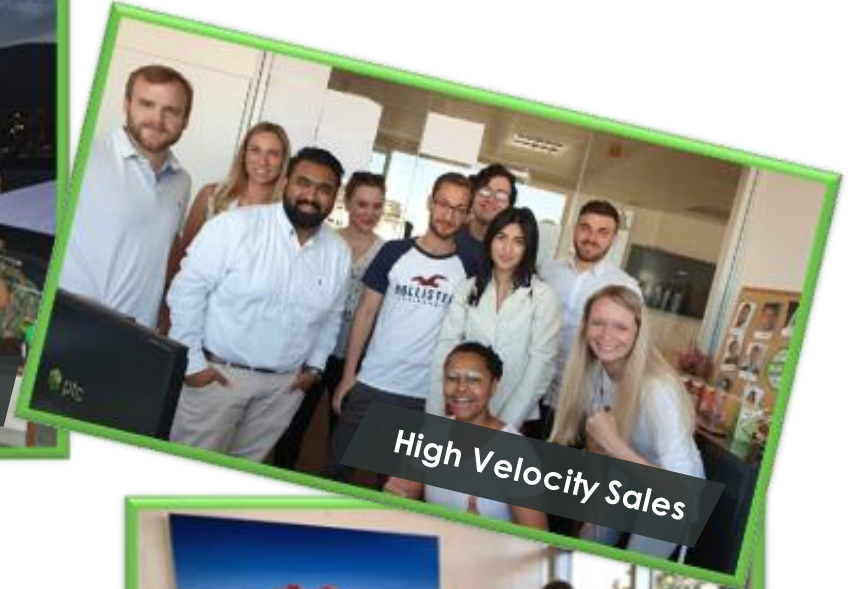
High Velocity Sales